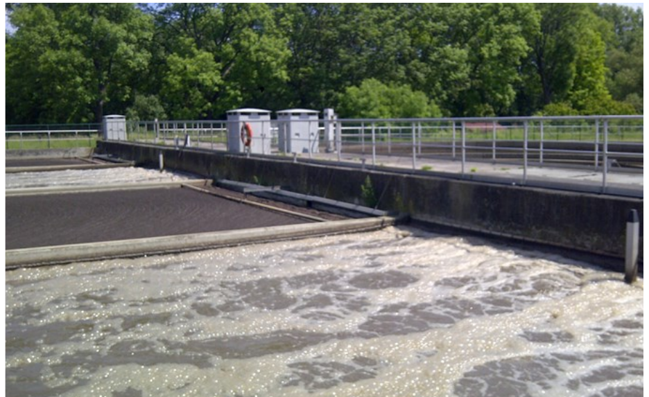
Wastewater treatment plant Gotha

The wastewater treatment plant in the city of Gotha, located in the county of the same name, has been built in 1993 and treats the wastewater of the city of Gotha as well as of surrounding villages. At the time of its construction it was one of the most modern of its kind. The treatment plant is designed for 150,000 PE and currently loaded with a COD equivalent of approx. 82,000 PE. The biological treatment had been realized via two looped aeration tanks with a total volume of 23,000 m 3 , a downstream circular tank for phosphate elimination as well as four secondary sedimentation tanks.